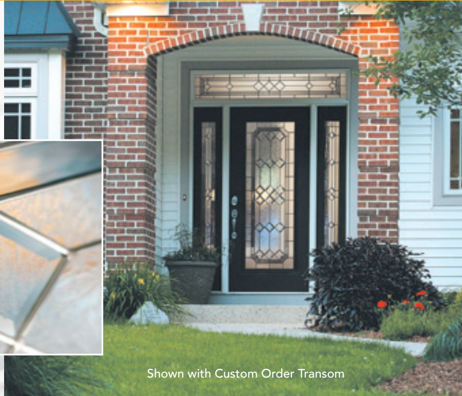
Shown with Custom Order Transom